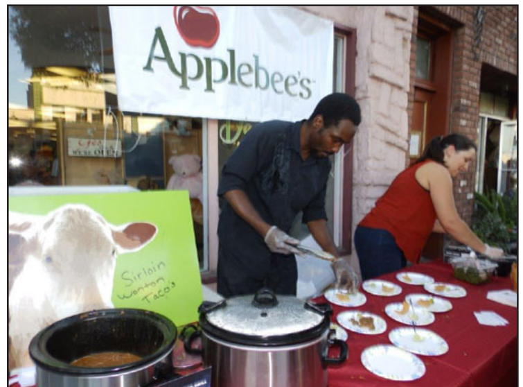
Judges Choice: Applebees Steak Wonton Taco